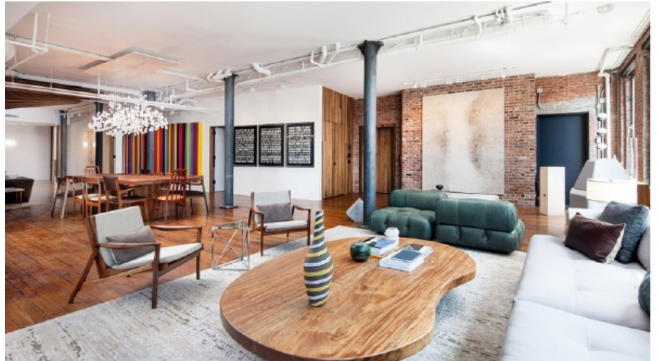
545 West 20th Street | 4 Bedrooms | 3.5 Baths | Sold: $7,200,000